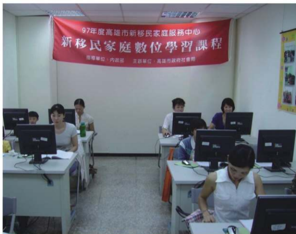
新移民家庭中心定期安排活動，讓新移民姐妹們一同參與。 The center holds regular holiday celebrations for foreign spouses to participate in and mingle.

Therefore, the center has authorized the Kaohsiung Christian Family Service and the Shepherd Life Association to provide counseling services for New Immigrant Spouses and Chinese spouses respectively. At the same time, to better assist foreign spouses in need, the Social Affairs Bureau has also set up eight community services branches within Nanzih, Siaogang, Sanmin, Cianjhen, Lingya, Cianjin Districts. Meanwhile, the bureau also helped to establish the Indonesian Sisterhood Association of Kaohsiung, the Vietnamese Sisters Association of Kaohsiung, and the Thailand-Philippine Sisterhood Association of Kaohsiung, in the hope of relieving their homesickness. This year, the bureau will do its best to