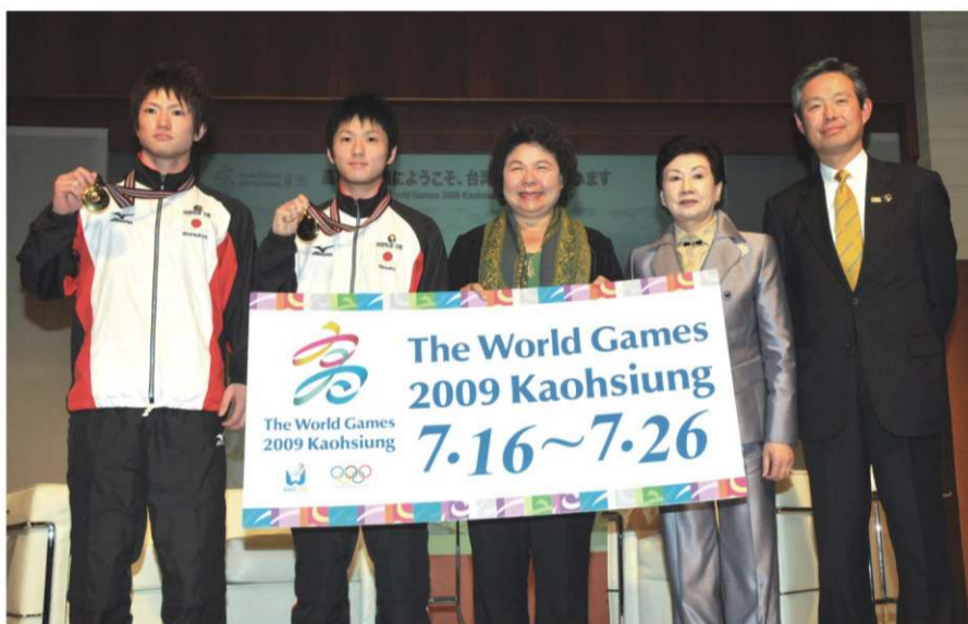
陳菊市長主持東京記者會時，熱情地邀請日本民眾及媒體，7月到高雄參加世界運動會。 While hosting the Tokyo conference, Mayor of Kaohsiung City, Chu Chen, extended a warm welcome to the Japanese public and media to visit Kaohsiung in July and participate in The World Games.