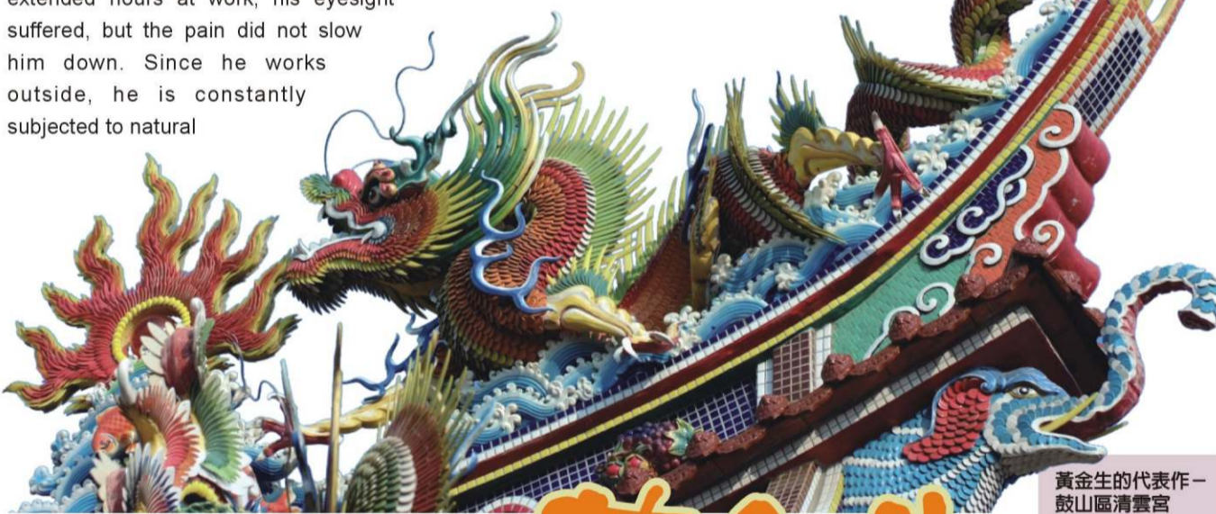
黃金生的代表作— 鼓山區清雲宮 Jin-Sheng Huang's masterpiece— Chinyun Temple in Gushan District

The crisis of losing the traditional fragmented ceramic art may occur due to the fierce price cut in the bids for historical monument restoration projects and use of cheap pre-molded material. The traditional fragmented ceramic art is becoming a "sunset industry" and we may lose it forever before we even realize it.