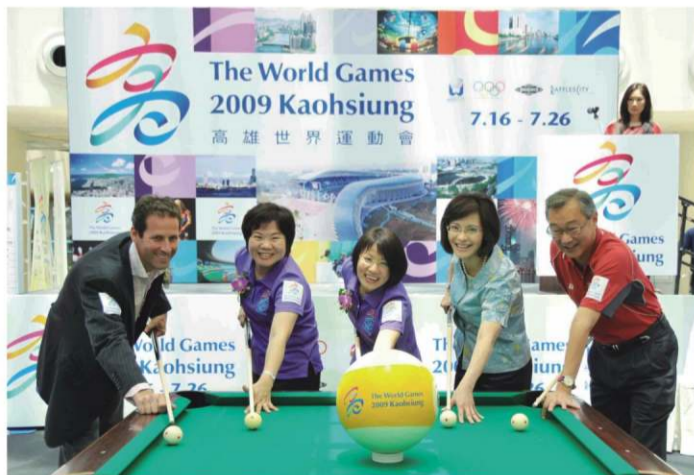
KOC代表團於4月至新加坡舉辦「高雄世運九號球前哨戰」宣傳活動。 In April, KOC held The World Games Kaohsiung 9-Ball Pre-Event in Singapore.

今年第一場行銷活動於3月5日在日本東京舉行，記者會由高雄市長陳菊親自主持。記者會中特別邀請負責「2009世運主場館」建築設計的伊東豐雄先生，與擔任高雄現代綜合體育館(高雄巨蛋)