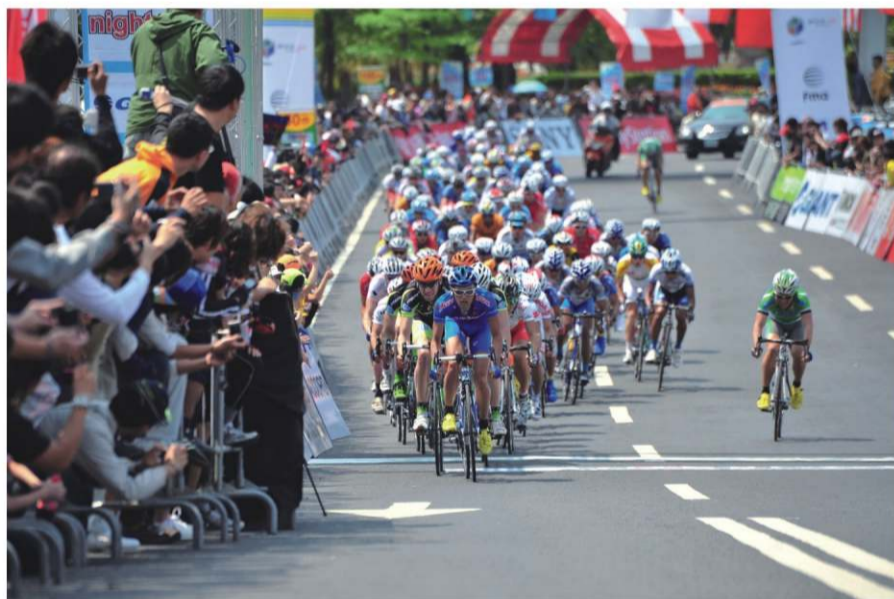
自行車選手在高雄站挑戰2.2公里的路程40圈。 In the Kaohsiung leg, cyclists competed against each other for forty 2.2 km laps.

Kaohsiung City has recently increased the length of its bike paths to 150 kilometers. It is also pioneering an urban public bike rental system. This allows people to rent bikes in one place and return them at another. The city government also aims to establish greener transportation systems. Part of this initiative includes allowing passengers to take their bikes with them on the Kaohsiung MRT. Cycling has enjoyed increased popularity in Kaohsiung City, following these efforts to promote the leisure activity. All the participants from this year's race have promised to return to Kaohsiung in 2010 to participate in the International Tour de Taiwan!