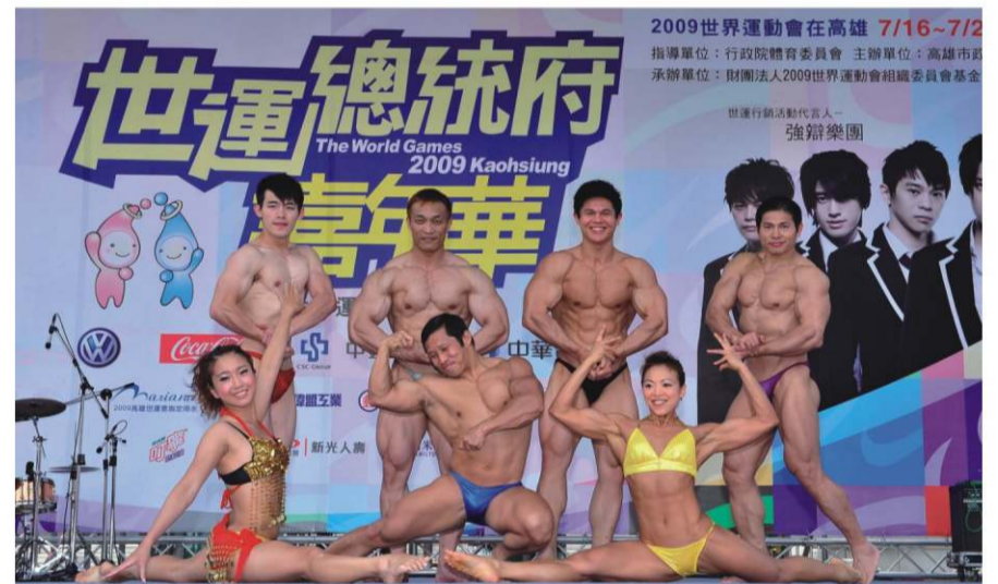
「總統府世運嘉年華」活動於總統府前廣場示範許多世運比賽項目。"The World Games Rollerblade Express Carnival" demonstrated various The World Games participating sports at the Office of the President Plaza.