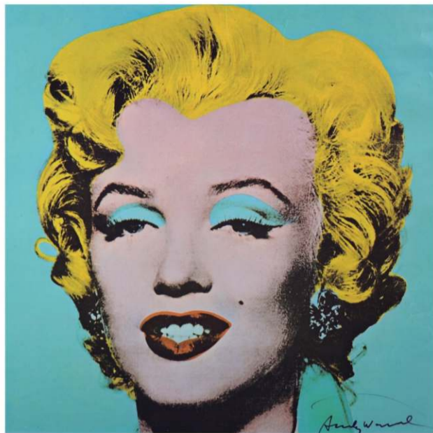
瑪麗蓮·夢露 平板印刷 Marilyn Offset

This exhibition includes more than 120 pieces of Andy Warhol's most representative original work on different media from different periods; from the 1950s when he had just begun to form his own style, up to the 1980s. The exhibition also features a series of some 30 candid portraits of the artist shot in the year 1975 by Italian photographer Dino Pedriali. The