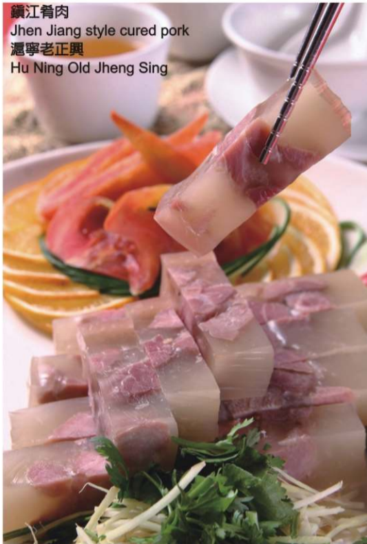
鎮江肴肉 Jhen Jiang style cured pork 滬寧老正興 Hu Ning Old Jheng Sing

fifteen year old apprentice. Under the tutelage of an older Shanghainese chef, he learned the secrets to creating authentic Chiang Che cooking and became an expert at presenting the freshest, tastiest and aromatic food. However, that was just the beginning. Over the years he has made various adjustments to his cooking methods. He makes sure his food isn't overly greasy, salty or sweet, short comings Chiang Che chefs are often criticized for. On the menu are all the classic Chiang Che (sometimes referred to as Hu Ning) gourmet dishes Popular dishes include fried eel