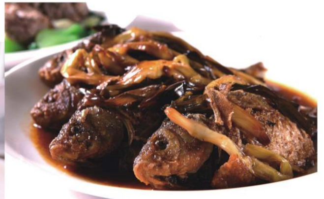
蔥烤鯽魚 Scallion braised crucian carp 統茂江浙海鮮樓 Tong Mao Chiang Che Seafood Restaurant

fifteen year old apprentice. Under the tutelage of an older Shanghainese chef, he learned the secrets to creating authentic Chiang Che cooking and became an expert at presenting the freshest, tastiest and aromatic food. However, that was just the beginning. Over the years he has made various adjustments to his cooking methods. He makes sure his food isn't overly greasy, salty or sweet, short comings Chiang Che chefs are often criticized for. On the menu are all the classic Chiang Che (sometimes referred to as Hu Ning) gourmet dishes Popular dishes include fried eel