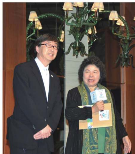
伊東豐雄(世運主場館的設計者)應邀出席東京記者會並和現場與會貴賓分享「2009世運主場館」的建築設計與特色。 Toyo Ito, designer of Main Stadium, was invited to the press conference in Tokyo and presented the stadium's design concepts and characteristics.

athletes from nearly 100 countries will compete in Kaohsiung this summer. Among the 31 sports, Sumo, Softball, and Gymnastics are most favored by Japanese people. Dance Sport and Rugby 7s are also popular sports