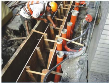
高雄市污水下水道接管普及率今年底將突破40%。 The Kaohsiung sewage network system is expected to complete more than 40% of the necessary pipe work by the end of this year.

Over the past few years, the number of new sewage pipes in Kaohsiung has been increasing, more so than other cities on the island. In relation to the development of the sewage network system plan, the Kaohsiung City Government is targeting 50.7% of the pipes to be connected by the year 2007, in which more than 40% of them will be completed by the end of 2005. At present, the construction of the sewage system is in the 3rd stage of development, which was planned to last from 1999 until 2007.